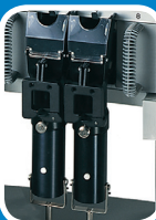
Different box and tubing solutions available